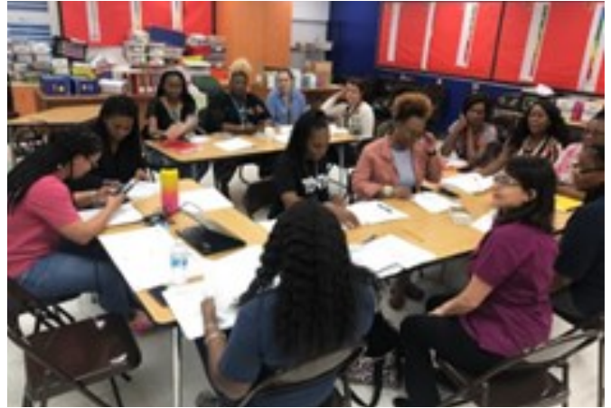
Grant Writing Workshop at Park Lakes Elementary School

Please contact GA if you would like us to facilitate your next program planning meeting or to request a grant writing workshop for your school or Department.